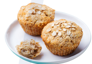
Homemade fruit muffins