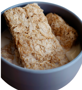
Weet bix & milk