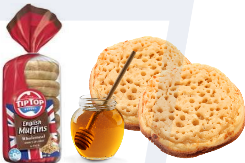
English Muffins or crumpets with honey or jam