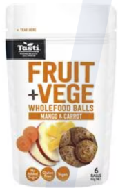
Tasti snack balls