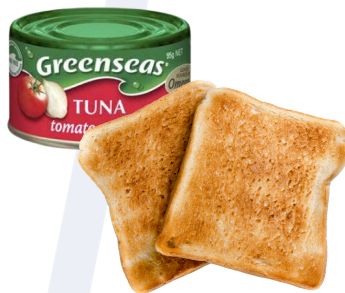
Tuna on lightly toasted bread