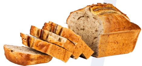
Homemade banana bread