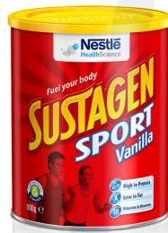
Sustagen Sport & milk