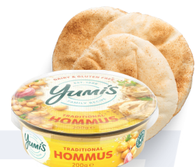
Pita bread and hummus