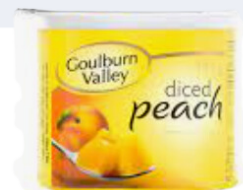
Fruit in juice