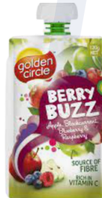
Fruit puree pouches